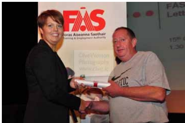
Presentation Day 2010 at FÁS