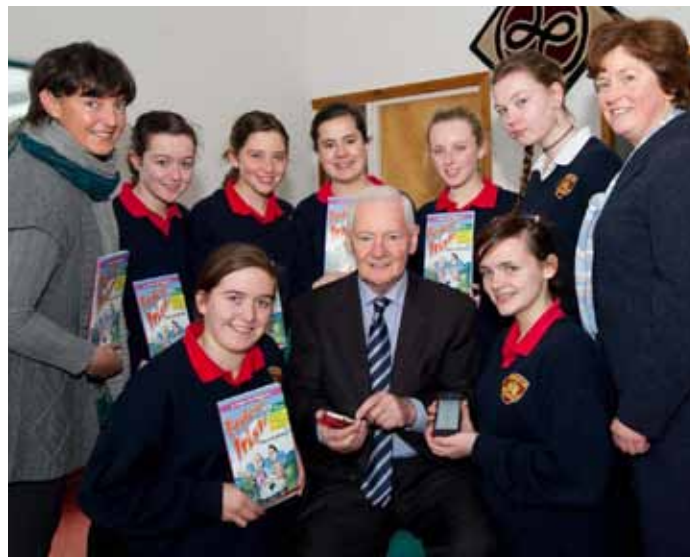
Minister for State for An Ghaeltacht, Dinny McGinley TD. launching the APP 'Enjoy Irish' in the company of students from Coláiste na Carraige.