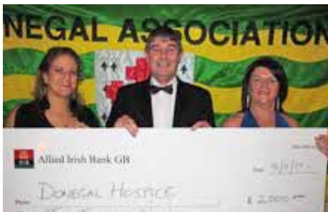
Presentation of cheque to Donegal Hospice

Founded in London in 1947, Donegal is now one of the most successful and innovative associations. The new website is just one more very important development. From help for individual people and their families in need,