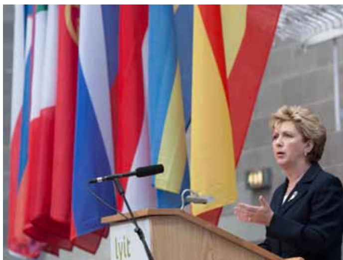
Former President Mary McAleese addressing the conference at LYIT

For further information visit: www.lyit.ie