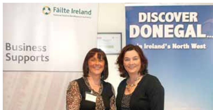
Failte Ireland displaying at the event

For more information on the Backing Ballyshannon Initiative – please visit www.backingballyshannon.ie or www.ballyshannon.ie