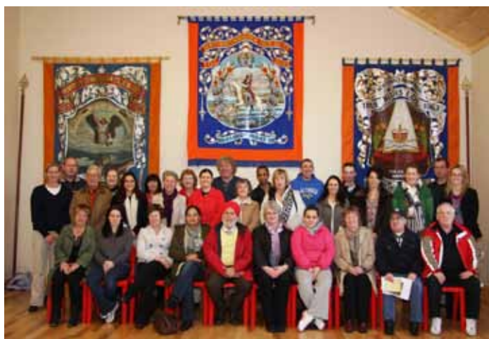
Pictured at the recently refurbished Newtowncunningham Orange Hall, Donegal are participants from community and voluntary groups in Donegal County and Derry City Council areas who took part in a four day capacity building course in Good Relations. Included in the photograph are organisers from both councils.