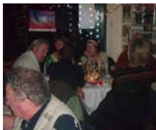
Enjoying the launch of the French Café nights

It is not often that one finds a genre and language of music which