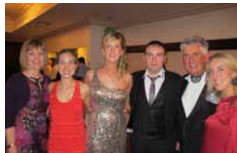
Groups enjoying the Annual Dinner Dance of the Donegal Association London

Today's Donegal Association has a number of young Irish professionals based in London on the committee, as well as a widely experienced team who have held various roles over the years.