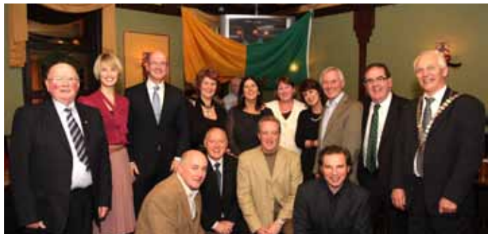
Some members of the Donegal Association Committee. Also the line spacing between the paragraphs can be reduced.