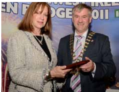
Senate President Therese Murray with Mayor Noel McBride