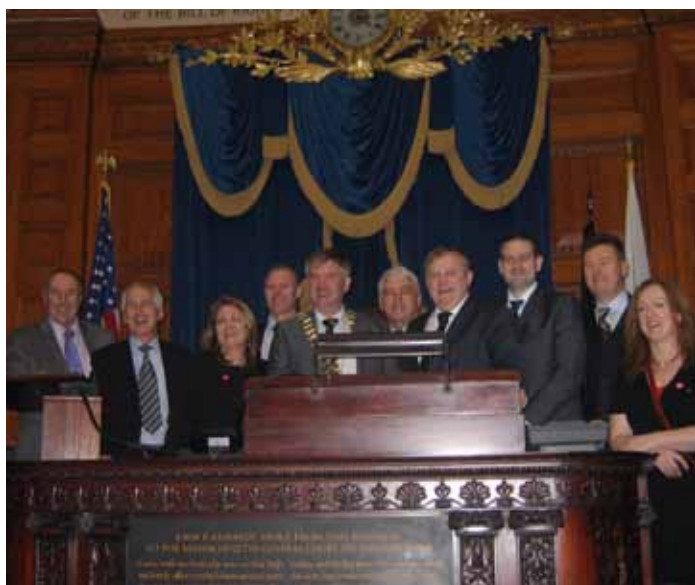
North West delegation pictured during their visit the Massachusetts State House in Boston in November 2011