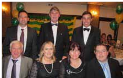
Donegal Association Committee